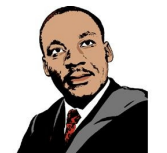
Martin Luther King, Jr. Day

The church office will be closed on Monday, Jan. 16th in observance of the MLK Jr. holiday. The office will reopen on Tuesday, Jan. 17th.